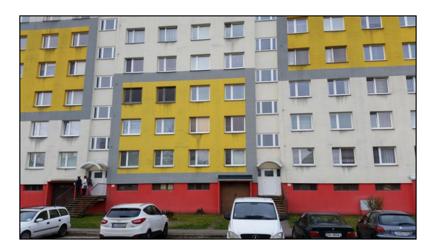
Fig.2: North facade – local contamination show process of water run-off from sill or thermal bridges in window to sill joints. (Antošová)

• samples from control buildings opposite the examined façade with no visible colour change, green or black deposits (fig. 8), one plaster was of the same type on the insulation construction and another plaster based on lime.