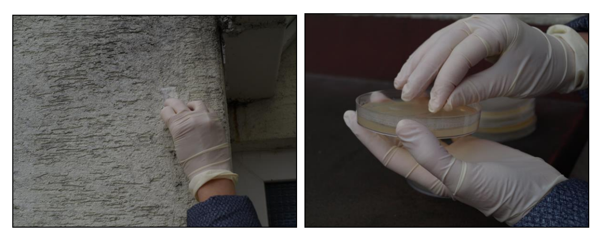
Fig.3, 4: Taking of samples with sampling tape (Fungitape) from the surface of contaminated plaster. (Antošová, Piecková)