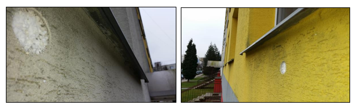
Fig. 5, 6: Localization of sampling.