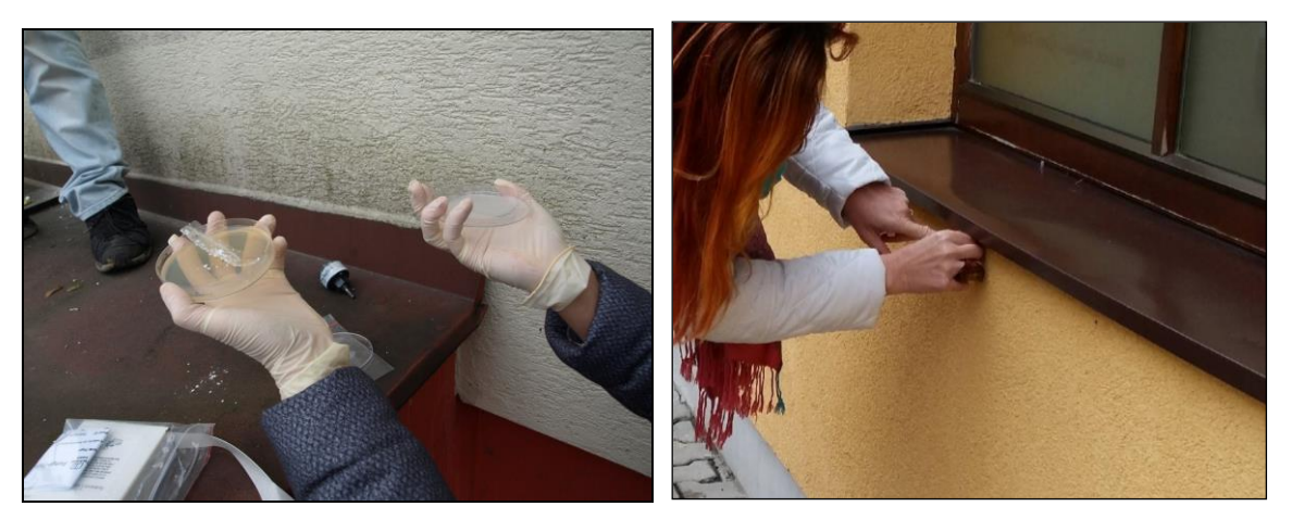
Fig. 7: Sampling by tape from the strata under the plaster. Fig. 8: Sampling of surrounding façades- without insulation- for comparison.

Isolation of pure cultures of micro-organisms on the surfaces of building materials is not easy. Given the fact that the laboratory provides the most provable analysis of bio deterioration (microbial corrosion) of building materials by eukaryotic micro-organisms (microscopic fungi - "fungi" and algae) includes just mycological tests [7]. Façade with insulation and the surrounding exterior have been studied by comprehensive qualitative and quantitative mycological examination (Fig. 8). The relevant microbial findings were then tested for their biodegradation potential on the components of the construction materials (Fig. 9).