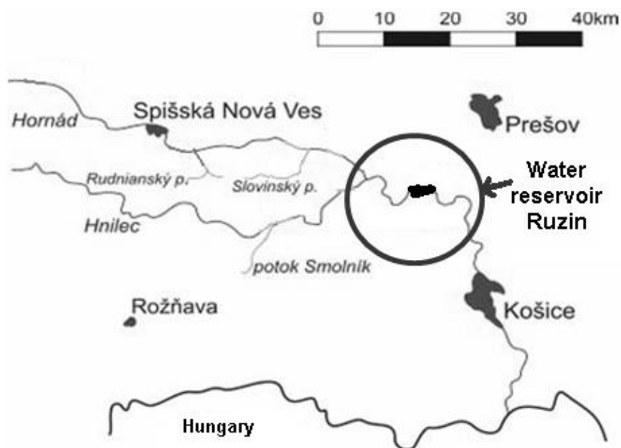
Fig. 1: Location of the investigated area on the map of the Slovak Republic

Deposit Smolník is a historical Cu, Fe, Ag, Au-mining area that was exploited from the 14th century to 1990. The mine-system represents partly opened geochemical system into which rain and surface water drain. The Smolník mine was definitely closed and flooded from 1990 till 1994 [7, 8]. The whole mine complex produce large amounts of AMD, discharging from the flooded mine (pH = 3-4, Fe 500-400 mg/l; Cu 3-1 mg/l; Zn 13-8 mg/l and Al 110-70 mg/l), that acidified and contaminated the Smolník creek water which transported pollution into the Hnilec River catchment [9, 10]. Figure 1 shows sediment location of Smolník creek, Hnilec and water Reservoir Ruzin on the map of East Slovakia.