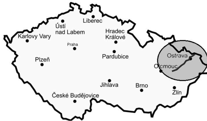
Fig. 1: Location of described part of the D1 motorway in the Czech Republic [13]

D 47 project is a project of ex-motorway which was originally proposed in the direction Brno-state border with Poland. Project was changed several times, shortened and gradually moved under the project of D1 motorway which now represents the whole corridor Prague-Brno-Ostrava. Created continuous motorway corridor is connected in Poland to the motorway A1 and reaches the length 377 km. D 47 project remained just on the paper and in the number coding system of the constructions. Part of the D1 motorway starts at Lipník nad Bečvou and continues to the border with Poland. The motorway can be seen in the national scale from the Fig. 1. [13, 14, 15]