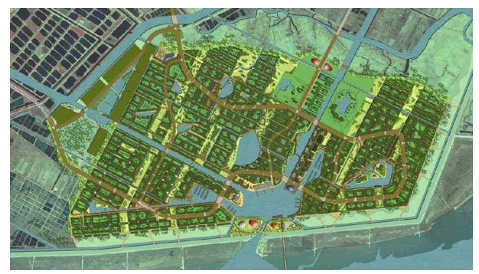
Fig. 1: Eco-city Dongtan

The City is located on the coast of East China Sea, as there were problems related to sea-level rise and the flooding. This problem was solved by building of artificial lakes linked underground to the sea in various parts of the city, serving as communicating vessels, and regulates the level of the sea through water level of lakes built within the city (fig. 1, [22]).