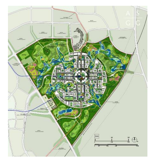
Fig. 5: Tianfu Ecological City Master Plan

International Scientific Conference People, Buildings and Environment 2014 (PBE2014) 15-17 October, 2014, Kroměříž, Czech Republic, www.fce.vutbr.cz/ekr/PBE