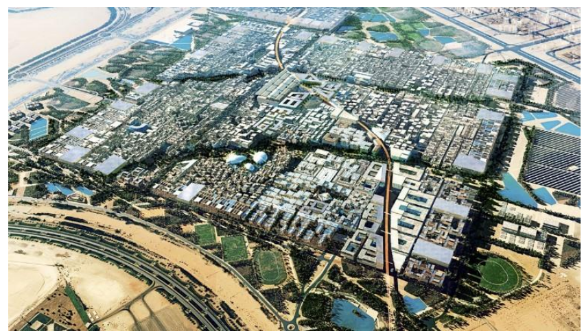
Fig. 4: Masdar City

This project assumes a 60% lower water consumption, gained through solar desalination plant, 80% of the water used will be recycled and used long as possible, at the end is used for the cultivation of agricultural crops. The city is trying to reduce waste by means of biodegradable waste which is used as fertilizer, recyclable waste is recycled and the remaining waste is combusted at a local plant which converts the waste into energy. As Masdar City is located in the desert, it was necessary to provide coolness. This problem has been secured by architects through narrow streets on which adjacent buildings shall provide enough shade and whereas they are straight and air is blown into them by windbreaks is also secured sufficient air movement. The temperature on Masdar's streets is generally 15 to 20°C cooler than the surrounding desert. On the main square are located 54 large-scale umbrellas, which are adapted to sunlight and moving together with the sun. Umbrellas are covered with solar panels and in addition to shielding they produce electricity. "There are also no light switches or water taps in the city; Movement sensors control lighting and water in order to cut electricity and water consumption by 51 and 55 percent respectively". [30]