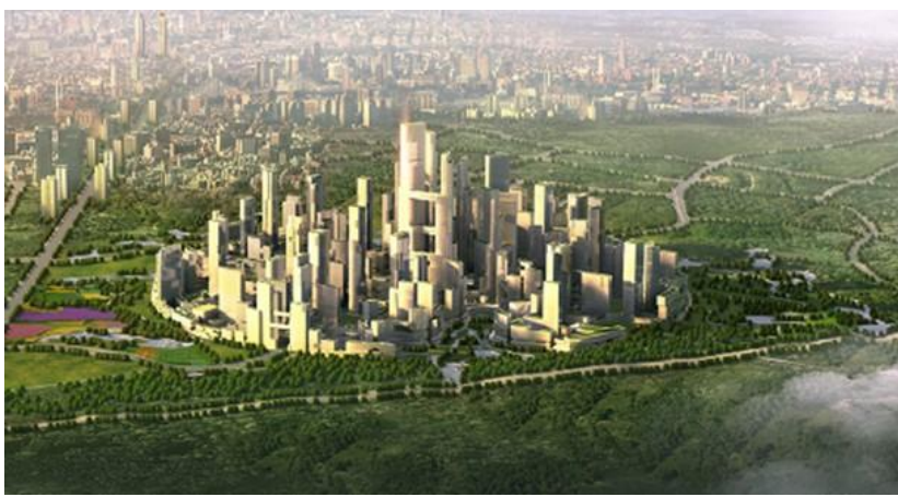
Fig. 6: Tianfu Ecological City

Construction will be realized in the territory, which has so far been used only as agricultural land – so this will involve greenfield land. The project takes into account the preservation of farmland outside the city, which will be reserved for farming and public spaces at least 60% of the total of 800 acre area. Complete natural topography including valleys, rivers and water bodies will naturally be incorporated into the project without other significant artificial interventions (fig. 6, [31]). All residential units will be within the two-minute walking distance from public parks.