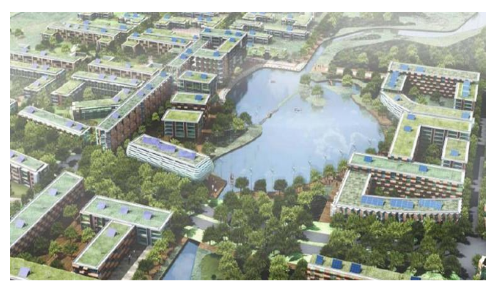
Fig. 2: Eco-city Dongtan

International Scientific Conference People, Buildings and Environment 2014 (PBE2014) 15-17 October, 2014, Kroměříž, Czech Republic, www.fce.vutbr.cz/ekr/PBE